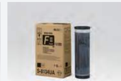
RISO INK FIL TYPE HD BLACK (1000 ml)