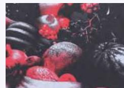
Printed by previous models