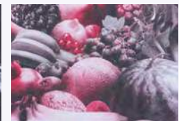
Printed by the RISO MH series