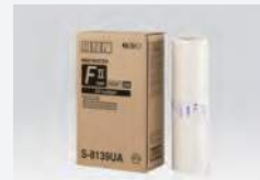
RISO MASTER FIL TYPE HG97 RISO MASTER FIL TYPE HD87 (Ledger: 215 sheets)