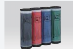
RISO INK FIL TYPE Color (1000 ml)

The RISO iQuality mark indicates a RISO product compatible with the RISO iQuality System.