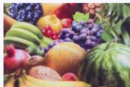
Photo document (original before scanning)

The MH series has achieved higher photo quality in scanning. When scanning a document with photos, it provides beautiful two-color separation of the photos and smooth tonal gradation even with photo images. In addition, equalized dot description reduces blown-out highlight areas.