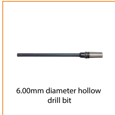
6.00mm diameter hollow drill bit