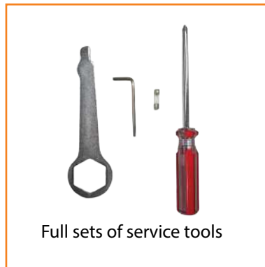
Full sets of service tools