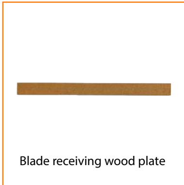
Blade receiving wood plate