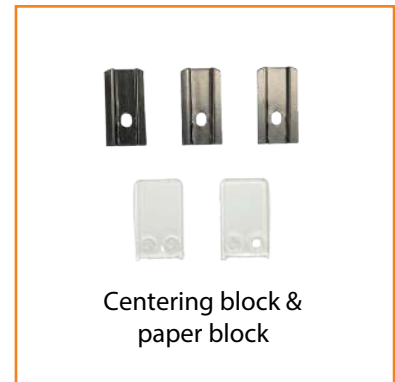
Centering block & paper block