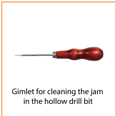
Gimlet for cleaning the jam in the hollow drill bit