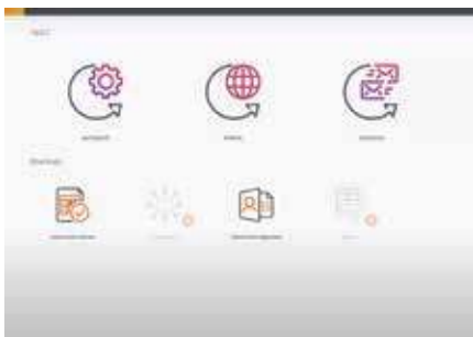
Quadient Impress Cloud Homepage

Quadient Impress Cloud is designed to eliminate the barriers presented by your management and allows your organization to work together in generating more effective customers communications. This solution helps to solve tasks without involving IT specialists or any third party.