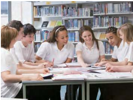
School, College, University Church