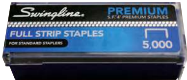
1 box of staples (Included)