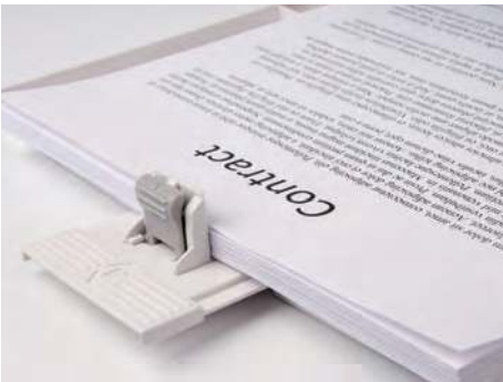
Copy shop Print shop