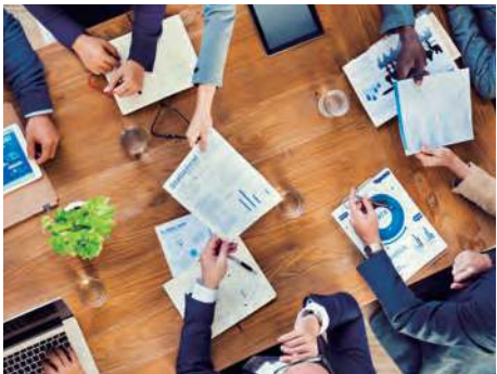
Office Small Business