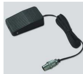
Foot switch for all models.