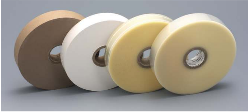
Kraft paper tape White paper tape Magic-cut tape Transparent film tape