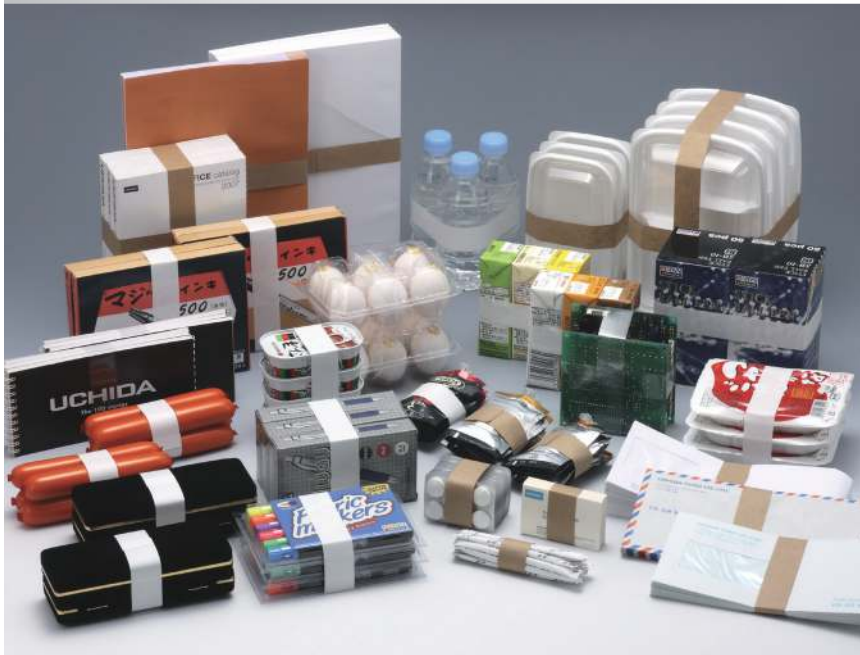
Bundling optimize your workflow in graphic, food, packaging, logistics, pharmaceutical and more industries.