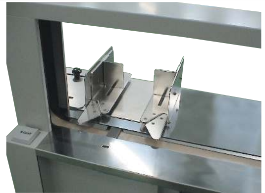
Auxiliary guide for soft materials helps bundling such as envelopes, letter papers etc. (For Tapit-WX, WII+)