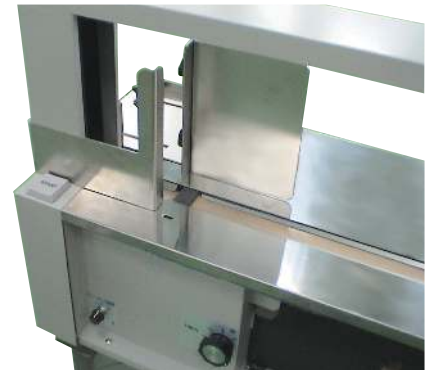
Auxiliary guide for small materials is a great solution for bundling business cards, tags, labels etc. (For Tapit-WX, WII+)