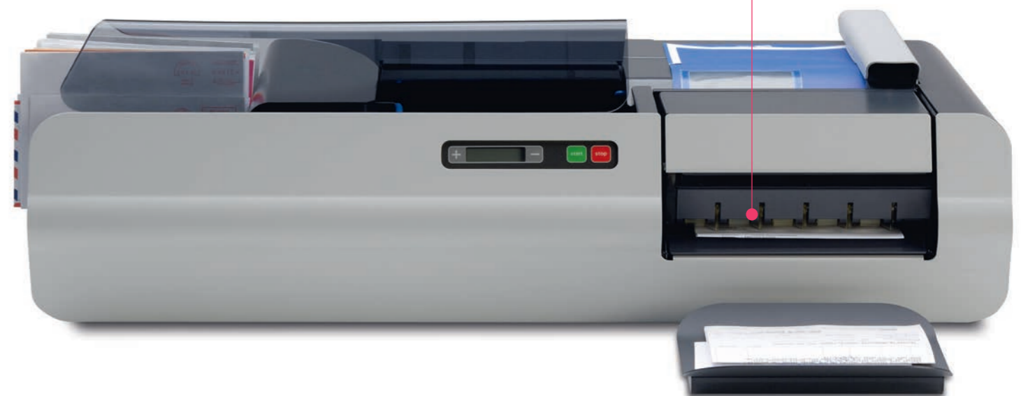
Full automatic content extraction on IM-35

The clear and simple control panel is self-explanatory and applications can be changed at the touch of a button. The user can concentrate on the core task: sorting and distributing incoming mail as fast and accurately as possible.