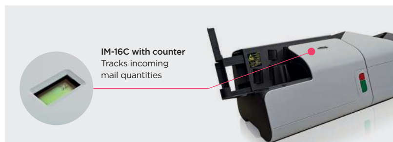
IM-16C with counter Tracks incoming mail quantities