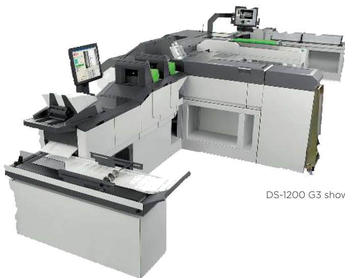
DS-1200 G3 shown