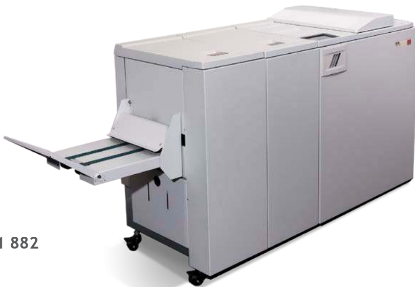
Below with Squarefold

The Trimmer supports “multi-cut” operation. This allows customers to trim more than 16mm to create booklet sizes