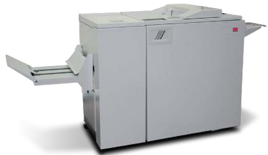
Above with No Squarefold