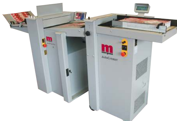
Picture shows AutoFold Pro with Morgana AutoCreaser

The beauty of the AutoFold Pro is its simplicity allowing the user of ANY manufacturer's creaser to invest in one and to improve their productivity and quality immediately.