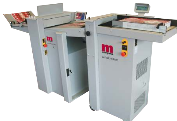
Picture shows AutoFold Pro with Morgana AutoCreaser

The beauty of the AutoFold Pro is its simplicity allowing the user of ANY manufacturer's creaser to invest in one and to improve their productivity and quality immediately.