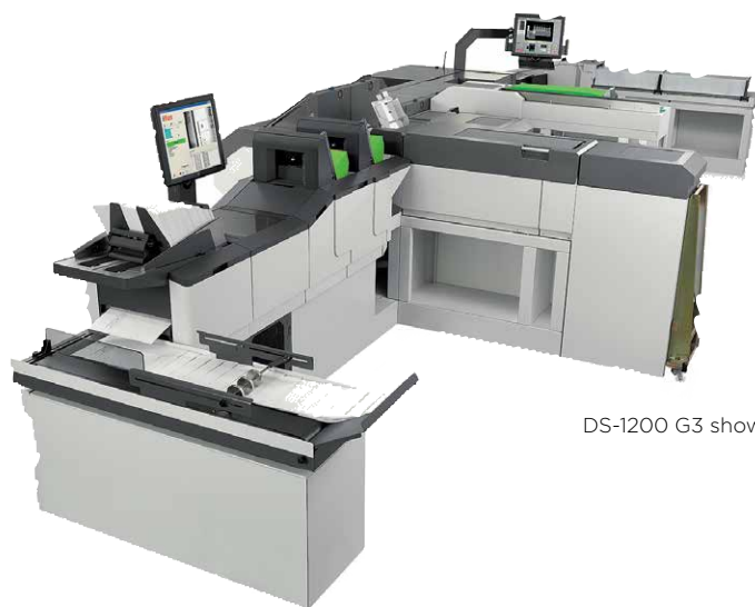
DS-1200 G3 shown

For more information about Quadient, visit quadient.com .